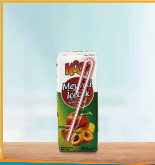
Peach & Apricot Drink