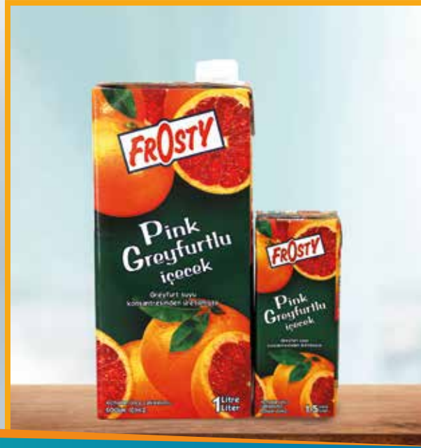
Pink Grapefruit Drink