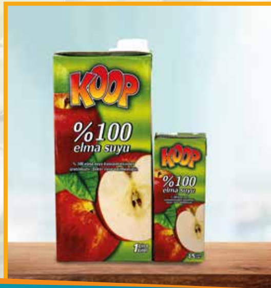
100% Apple Juice