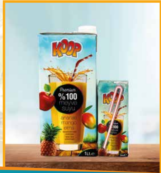
Premium 100% Fruit Juice