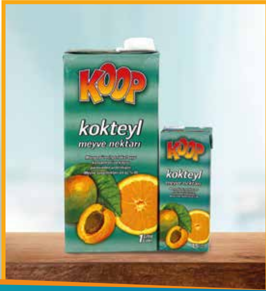
Fruit Cocktail Nectar