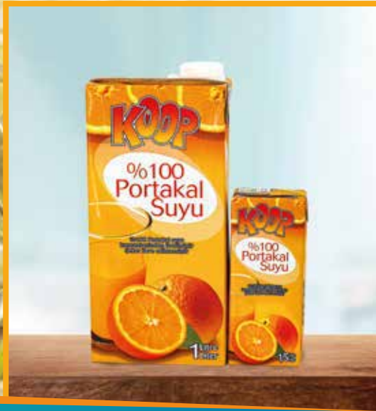
100% Orange Juice