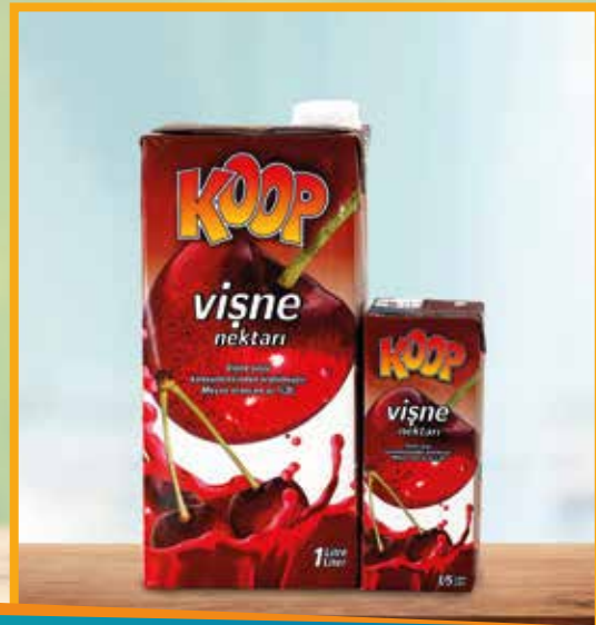
Sour Cherry Nectar