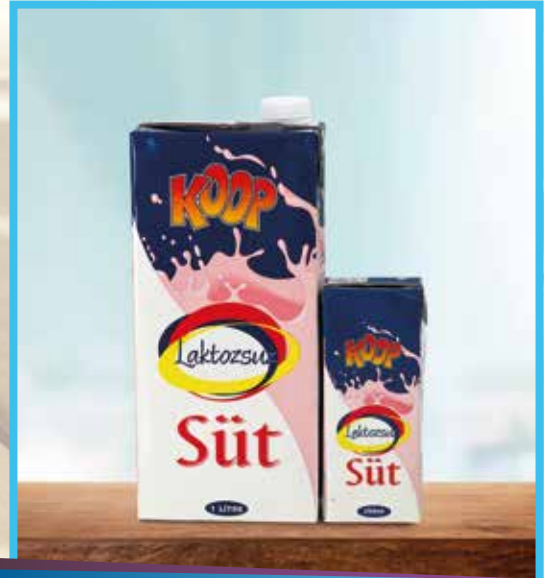
Lactose Free Milk