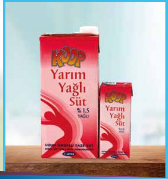
Semi Skimmed Milk