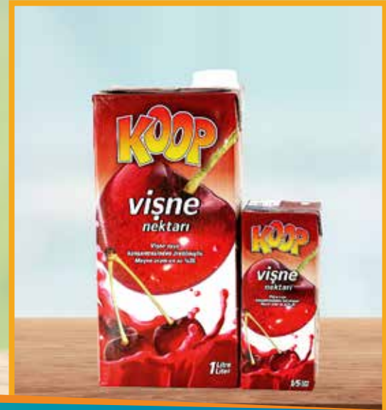
Sour Cherry Nectar