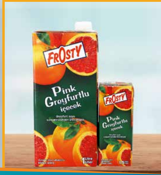
Pink Grapefruit Drink