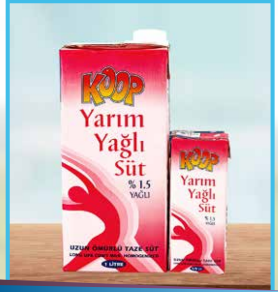
Semi Skimmed Milk