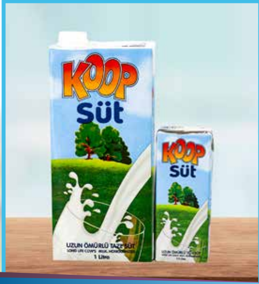
3% Fat Milk