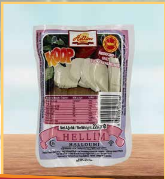
Reduced Salt Halloumi