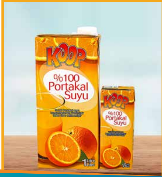
100% Orange Juice