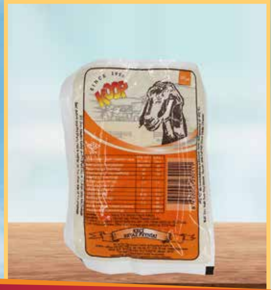
Goat White Cheese