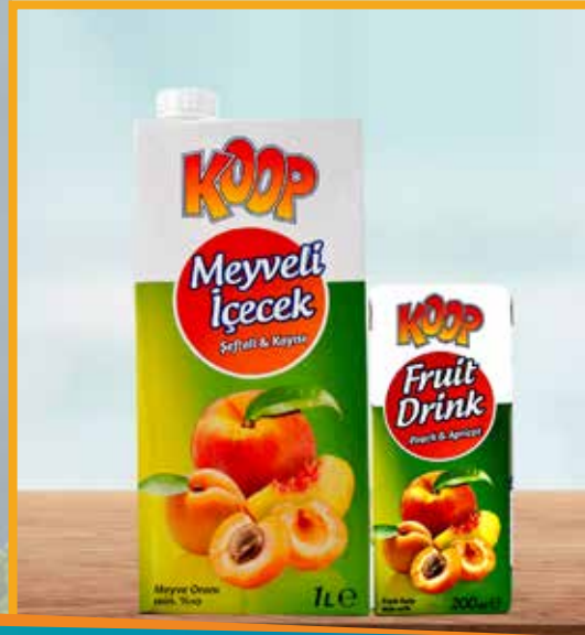
Peach & Apricot Drink