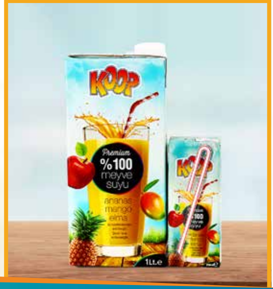
Premium 100% Fruit Juice