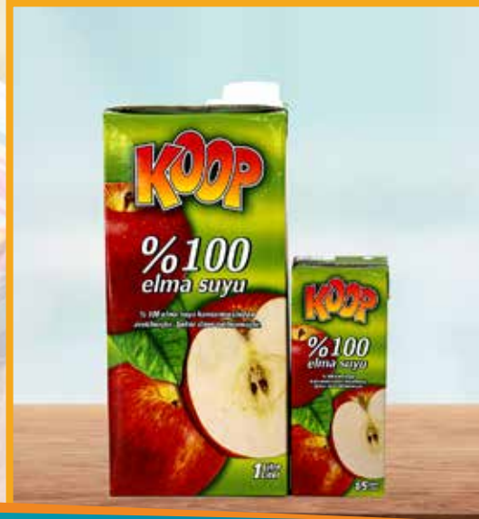
100% Apple Juice