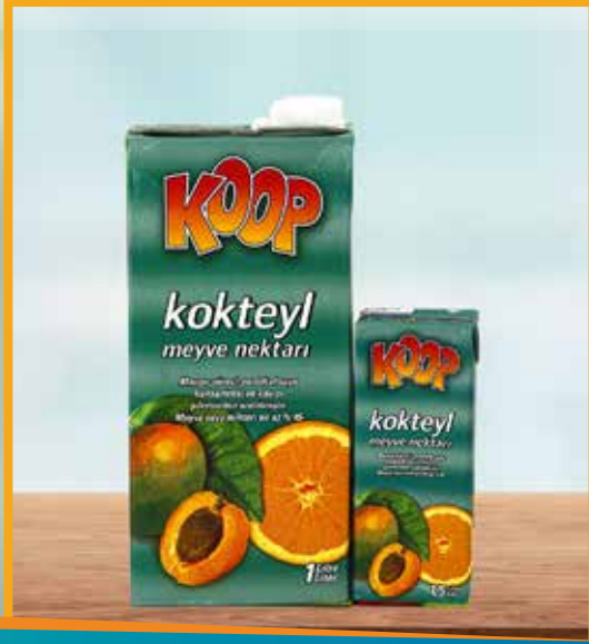
Fruit Cocktail Nectar