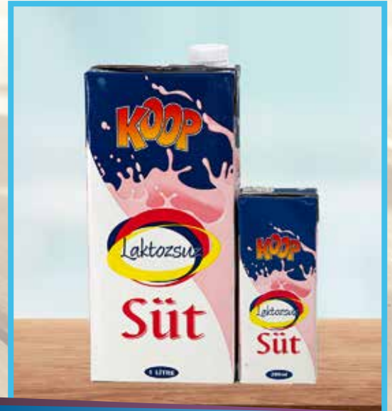
Lactose Free Milk