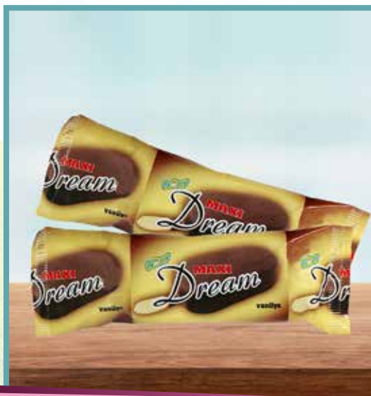
Max Dream Vanilla